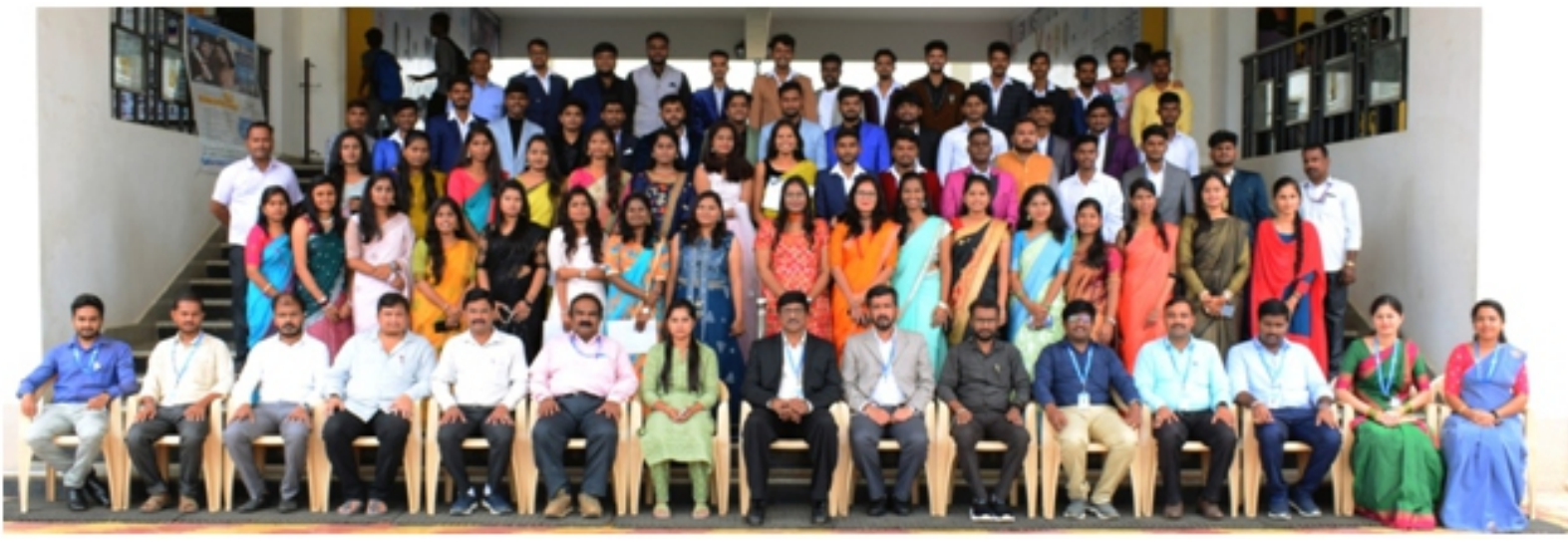
Department of Civil Engineering has organized forum valedictory and farewell to final year students on 18<sup>th</sup> July 2022.