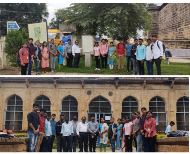
Department of Civil Engineering has organized a technical visit to Santebennur as a part of AICTE activity on 20^{th} July 2022.