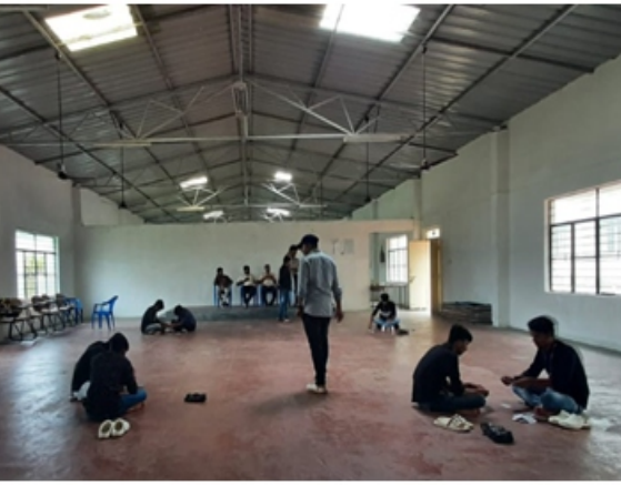
Department of Civil Engineering has organized Technical event card structures as a part of 17<sup>th</sup> State level ISTE student convention on 23<sup>rd</sup> July 2022.